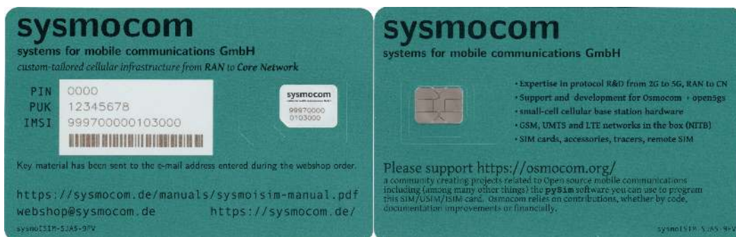
Figure 2: sysmoISIM-SJA5

The sysmoISIM-SJA5 are Java SIM card with the following specifications and features: