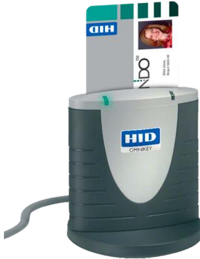
Figure 3: Omnikey CardMan 3121 USB CCID Smart Card Reader