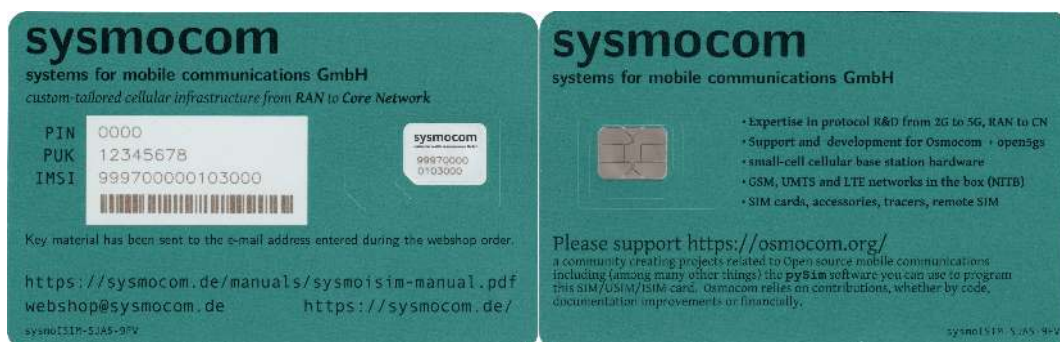
Figure 2: sysmoISIM-SJA5

The sysmoISIM-SJA5 are Java SIM card with the following specifications and features: