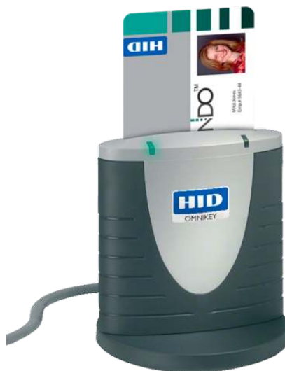
Figure 4: Omnikey CardMan 3121 USB CCID Smart Card Reader

sysmocom offers suitable USB CCID compliant card readers at https://shop.sysmocom.de/SIM/Card-Readers-Writers/